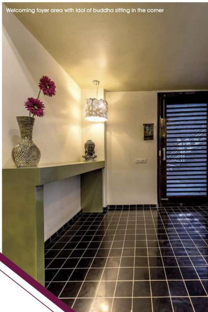
Welcoming foyer area with Idol of buddha sitting in the corner

in a 227 yards plot generally. All in all, the house is a complete package of cleverly incorporated spaces, playing with materials and geometry to provide a dynamic yet humane environment for the client and his family.